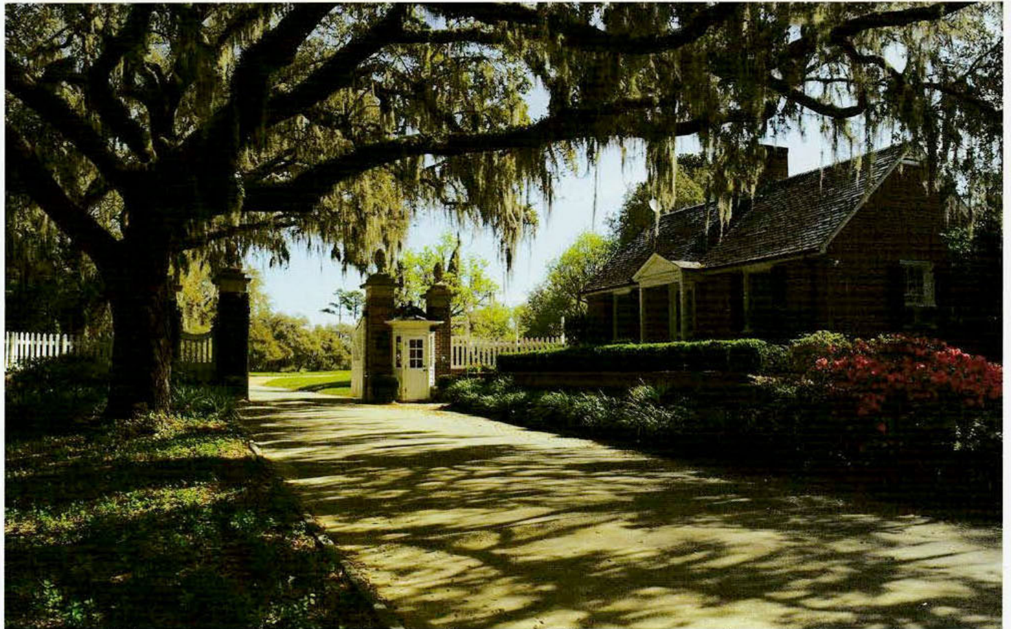
When you reach the gate house at Yeamans Hall, you know you've arrived someplace special.