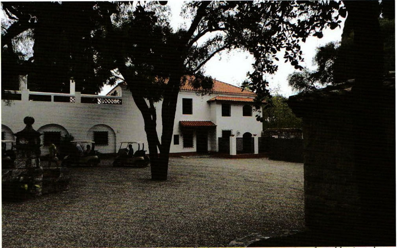
The small hotel at El Potrerillo de Larreta is an expansion of an old private home.