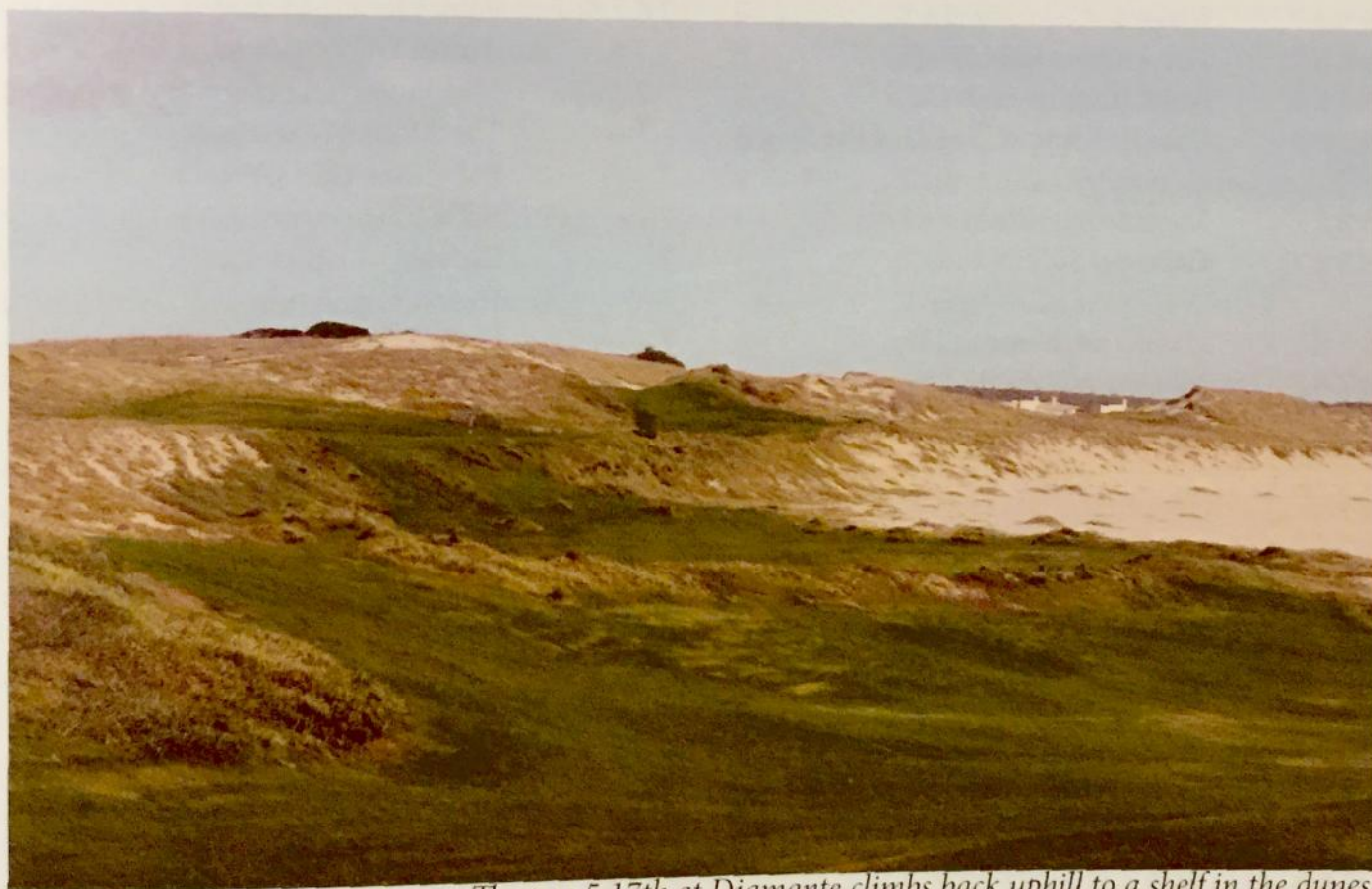
The par-5 17th at Diamante climbs back uphill to a shelf in the dunes.