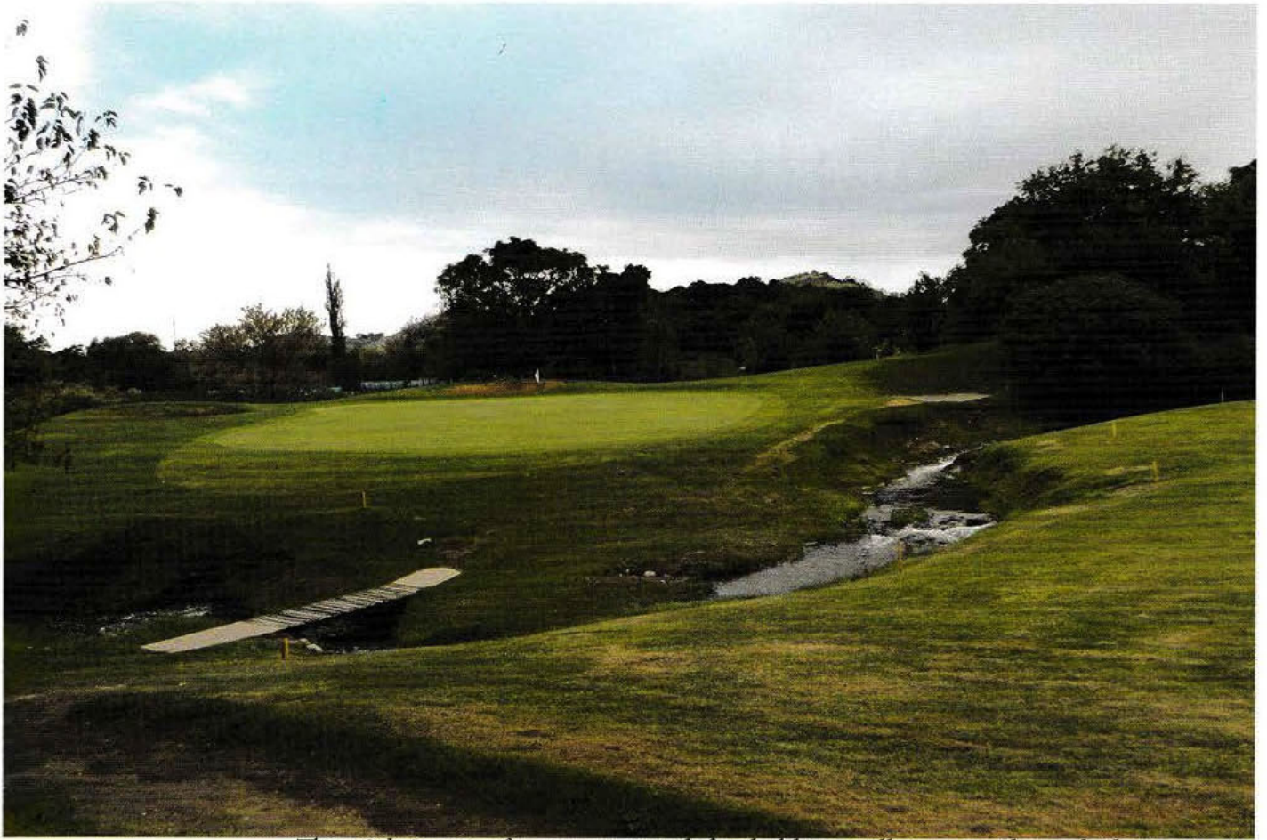
The 10th is one of many greens defended by small streams through the property.

The streams are also the centerpiece of the two best short holes on the course [of which there are five, to go with five par-5's]. At the 3rd, one climbs up to a tee to play across a stream which then wraps the left side of the green; the 7th is more of an island green, where the dammed stream guards the right front of the green, which is shoved up against the steep bank of the valley at its left. There is a beautiful waterfall where the pond ends, but you appreciate it once you leave the green, en route to the next tee.